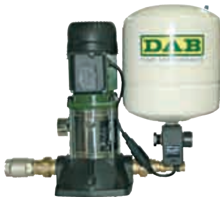
FLE-PWB18V Pressure Tank not included in price