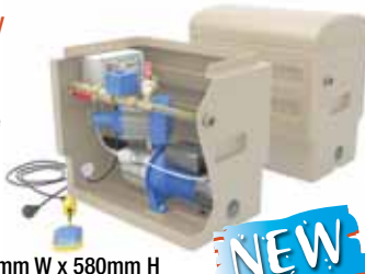
540mm L x 375mm W x 580mm H

Auto Mains Water Switching Device with the intelligence to switch between mains water & tank water as necessary.