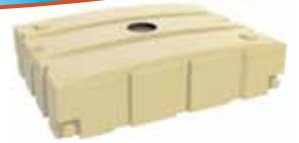
2000L Underdeck Tank 1785mm W x 2360mm L x 550mm H